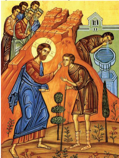
Healing of a man born blind – Gospel of John 9:1- 41

The great theme of the letter to the Ephesians is the unity of Christians: the Church, including Jews and non-Jews alike, is one body; all are members of Christ through Baptism, living in the one Spirit. The writer urges all members of the Church to live in daily awareness of their unity with Christ and one another, guided by divine Spirit. Life with or without Christ is compared to living in the light or living in darkness. Unlike many people today, ancient peoples were very aware that without adequate light, one could see little or nothing. For those dependent upon daylight or the limited light of the oil lamps or candles, the symbolism was powerful. The newly baptized received a lighted candle reminding them of their commitment to see all things in the light of Christ. Thus the author urges all the baptized to be united in rejecting all that is not of Christ as that which belongs to darkness. Instead, those who are one with Christ and his Body on earth, the Church, must live as those who walk in the light of the Risen One.